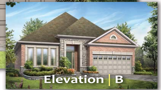
Elevation | B